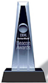
Beacon Award Winner

PSC has been a IBM Lotus Beacon Award finalist six times in the past 7 years - Winning in categories such as Best People Centric SOA Solution.